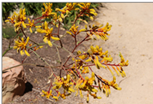
Yellow Gem Kangaroo Paw flowers

Yellow Gem Kangaroo Paw is recommended for the following landscape applications;