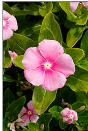
Cora Cascade Shell Pink Vinca flowers

Cora Cascade Shell Pink Vinca is recommended for the following landscape applications;