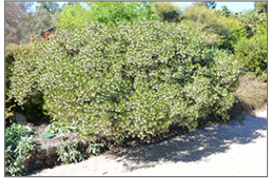
White Lanterns Manzanita in bloom

White Lanterns Manzanita is recommended for the following landscape applications;