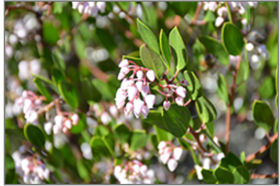
White Lanterns Manzanita flowers

This shrub does best in full sun to partial shade. It is very adaptable to both dry and moist growing conditions, but will not tolerate any standing water. It may require supplemental watering during periods of drought or extended heat. It is very fussy about its soil conditions and must have sandy, acidic soils to ensure success, and is subject to chlorosis (yellowing) of the foliage in alkaline soils, and is able to handle environmental salt. It is somewhat tolerant of urban pollution. This particular variety is an interspecific hybrid.