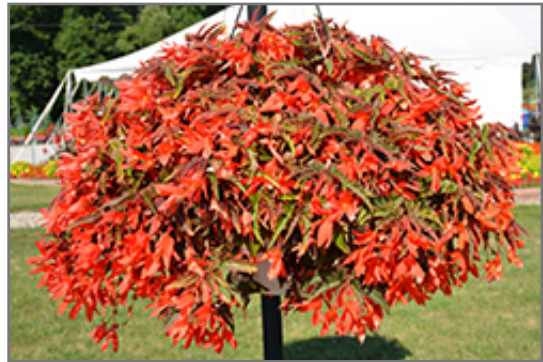
Bossa Nova Night Fever Papaya Begonia in bloom