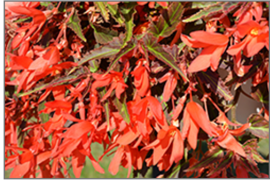
Bossa Nova Night Fever Papaya Begonia flowers