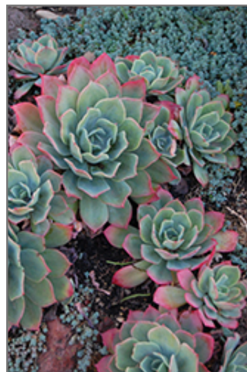
Blue Mist Echeveria

Blue Mist Echeveria is recommended for the following landscape applications;