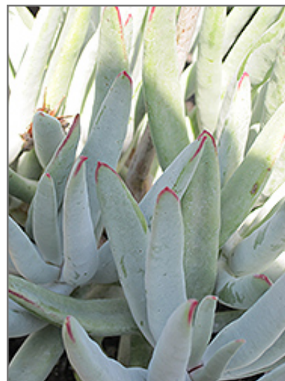
Flavida Finger Aloe foliage

Flavida Finger Aloe makes a fine choice for the outdoor landscape, but it is also well-suited for use in outdoor pots and containers. With its upright habit of growth, it is best suited for use as a 'thriller' in the 'spiller-thriller-filler' container combination; plant it near the center of the pot, surrounded by smaller plants and those that spill over the edges. Note that when grown in a container, it may not perform exactly as indicated on the tag - this is to be expected. Also note that when growing plants in outdoor containers and baskets, they may require more frequent waterings than they would in the yard or garden.