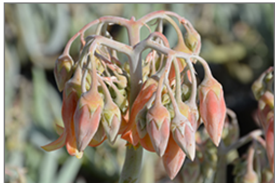
Flavida Finger Aloe flower buds

This is a relatively low maintenance shrub, and should never be pruned except to remove any dieback, as it tends not to take pruning well. It has no significant negative characteristics.