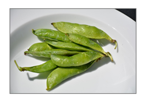
Little Marvel Garden Pea fruit

Super early maturing and high yielding, this heirloom variety is perfect for patio containers, balconies and small gardens; semi-dwarf bushes produces 4" long green pods full of sweet and tender peas; great for eating fresh or frozen