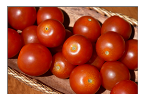
Husky Tomato fruit

Husky Tomato will grow to be about 24 inches tall at maturity, with a spread of 24 inches. When planted in rows, individual plants should be spaced approximately 3 feet apart. This fast-growing vegetable plant is an annual, which means that it will grow for one season in your garden and then die after producing a crop.