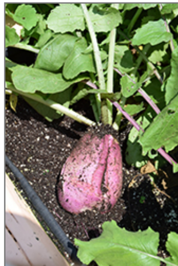
Sweet Baby Radish fruit

Sweet Baby Radish will grow to be about 10 inches tall at maturity, with a spread of 3 inches. When planted in rows, individual plants should be spaced approximately 3 inches apart. This vegetable plant is an annual, which means that it will grow for one season in your garden and then die after producing a crop. Because of its relatively short time to maturity, it lends itself to a series of successive plantings each staggered by a week or two; this will prolong the effective harvest period.