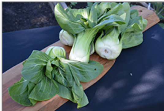
Bok Choy fruit

Bok Choy will grow to be about 24 inches tall at maturity, with a spread of 18 inches. When planted in rows, individual plants should be spaced approximately 18 inches apart. This fast-growing vegetable plant is an annual, which means that it will grow for one season in your garden and then die after producing a crop. Because of its relatively short time to maturity, it lends itself to a series of successive plantings each staggered by a week or two; this will prolong the effective harvest period.