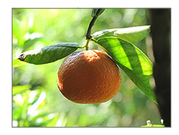
Clementine fruit

Clementine features showy clusters of fragrant white star-shaped flowers at the ends of the branches from early to mid spring. It has dark green evergreen foliage. The glossy oval leaves remain dark green throughout the winter. It features an abundance of magnificent orange berries with red overtones from mid fall to early winter.