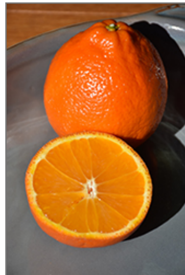
Minneola Tangelo fruit

Minneola Tangelo features showy clusters of fragrant white star-shaped flowers with buttery yellow eyes at the ends of the branches from early to mid spring. It has dark green evergreen foliage. The glossy pointy leaves remain dark green throughout the winter. It features an abundance of magnificent orange berries with red overtones from early to late winter. The fruit can be messy if allowed to drop on the lawn or walkways, and may require occasional clean-up.