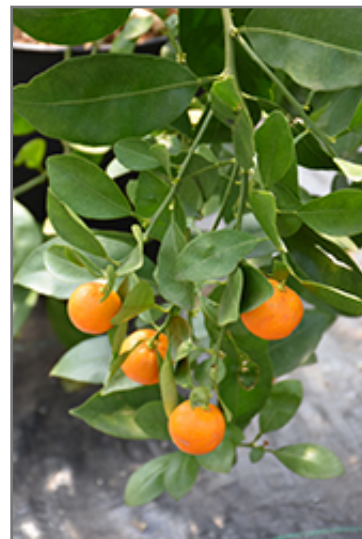
Minneola Tangelo fruit