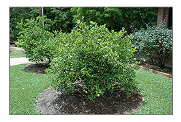
Meyer Dwarf Lemon