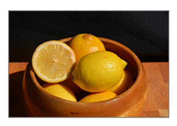
Meyer Dwarf Lemon fruit and flesh

This is a multi-stemmed evergreen shrub with an upright spreading habit of growth. Its average texture blends into the landscape, but can be balanced by one or two finer or coarser trees or shrubs for an effective composition. This is a relatively low maintenance plant, and is best pruned in late winter once the threat of extreme cold has passed. It is a good choice for attracting birds, bees and butterflies to your yard. It has no significant negative characteristics.