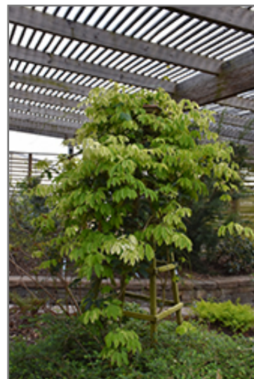
Cartwheel Variegated Stauntonia Vine