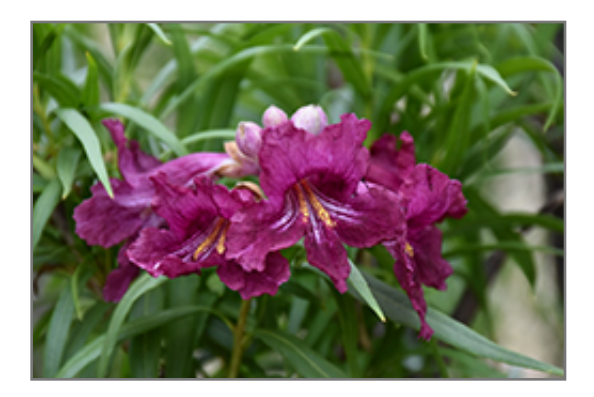
Burgundy Desert Willow flowers