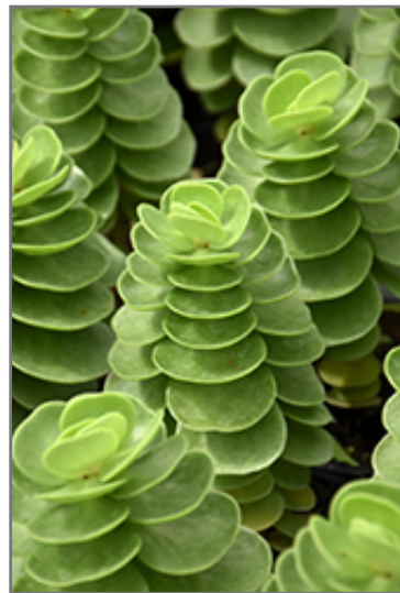
Ihi Portulaca foliage

Ihi Portulaca is recommended for the following landscape applications;