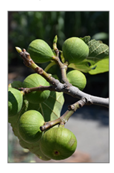
Black Jack Fig fruit