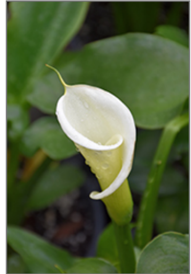
Large White Calla Lily flowers