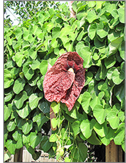
Giant Dutchman's Pipe flowers