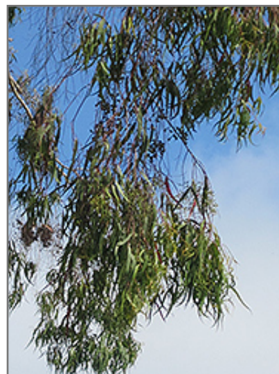
Lemon-scented Gum foliage