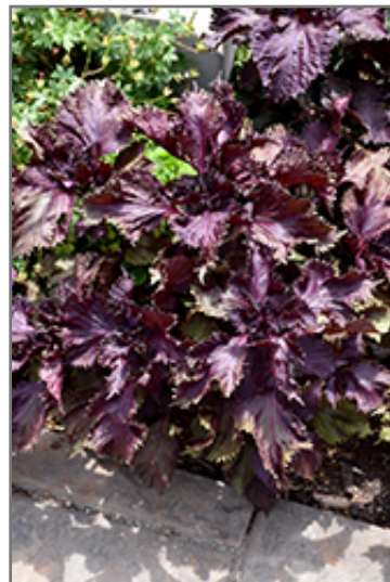
Red Shiso Perilla foliage

Dark red-purple leaves with burgundy veins on a dense bushy plant; a great garden accent or landscape plant that also works well in mixed containers; edible sprouts are used for flavoring food; performs well in sun or shade