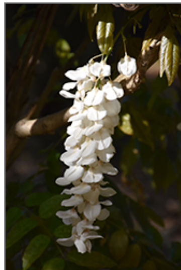
Silky Wisteria flowers