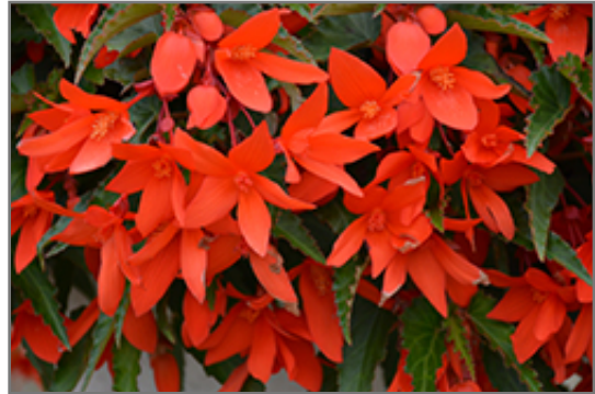
Waterfall Encanto Orange Begonia flowers