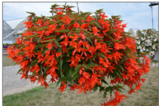
Waterfall Encanto Orange Begonia in bloom