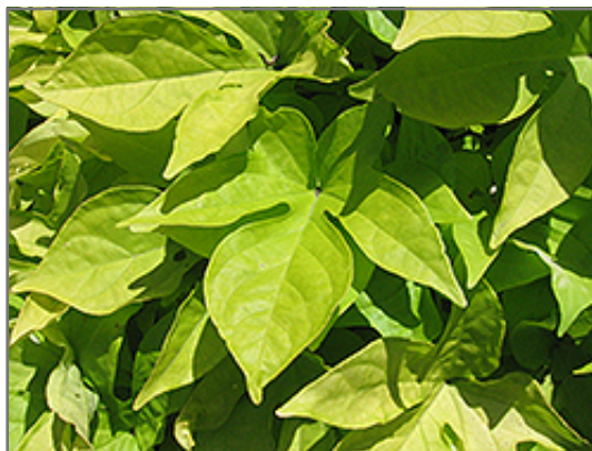
Sweet Caroline Light Green Sweet Potato Vine foliage

When grown indoors, Sweet Caroline Light Green Sweet Potato Vine can be expected to grow to be about 8 inches tall at maturity, with a spread of 5 feet. It grows at a fast rate, and under ideal conditions can be expected to live for approximately 1 years. This houseplant will do well in a location that gets either direct or indirect sunlight, although it will usually require a more brightly-lit environment than what artificial indoor lighting alone can provide. It does best in average to evenly moist soil, but will not tolerate standing water. The surface of the soil shouldn't be allowed to dry out completely, and so you should expect to water this plant once and possibly even twice each week. Be aware that your particular watering schedule may vary depending on its location in the room, the pot size, plant size and other conditions; if in doubt, ask one of our experts in the store for advice. It is not particular as to soil type or pH; an average potting soil should work just fine.