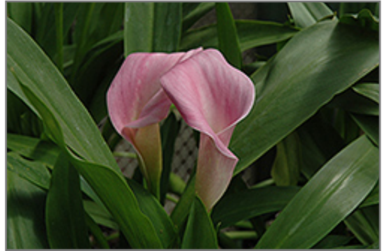
Ruby Sensation Calla Lily flowers

Other Names: Lily of the Nile, Easter Lily, Arum Lily