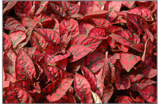
Splash Select Red Polka Dot Plant foliage