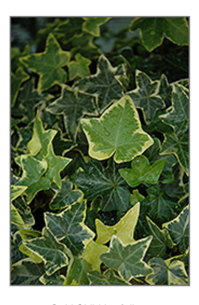
Gold Child Ivy foliage

When grown indoors, Gold Child Ivy can be expected to grow to be about 10 feet tall at maturity, with a spread of 3 feet. It grows at a medium rate, and under ideal conditions can be expected to live for approximately 30 years. This houseplant performs well in both bright or indirect sunlight and strong artificial light, and can therefore be situated in almost any well-lit room or location. It prefers to grow in average to moist soil. The surface of the soil shouldn't be allowed to dry out completely, and so you should expect to water this plant once and possibly even twice each week. Be aware that your particular watering schedule may vary depending on its location in the room, the pot size, plant size and other conditions; if in doubt, ask one of our experts in the store for advice. It is not particular as to soil pH, but grows best in rich soil. Contact the store for specific recommendations on pre-mixed potting soil for this plant. Be warned that parts of this plant are known to be toxic to humans and animals, so special care should be exercised if growing it around children and pets.