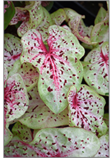
Miss Muffet Caladium foliage

This stunning variety offers speckles, splashes, and spectacular contrast; chartreuse leaves with white veins, splattered with burgundy spots and blush; a great container or basket plant, indoors or out