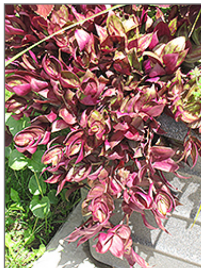
Purple Wandering Jew

This trailing perennial is grown for its foliage; lovely leaves of gray green and pink, with deep pink reverses; low maintenance, and excellent for indoor containers or baskets