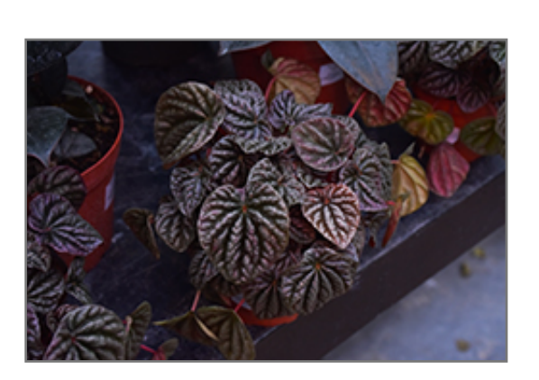
Theresa Peperomia foliage

When grown indoors, Theresa Peperomia can be expected to grow to be about 10 inches tall at maturity extending to 14 inches tall with the flowers, with a spread of 12 inches. It grows at a slow rate, and under ideal conditions can be expected to live for approximately 5 years. This houseplant should only be grown away from direct sunlight or in a room with strong artificial light. It does best in average to evenly moist soil, but will not tolerate standing water. The surface of the soil shouldn't be allowed to dry out completely, and so you should expect to water this plant once and possibly even twice each week. Be aware that your particular watering schedule may vary depending on its location in the room, the pot size, plant size and other conditions; if in doubt, ask one of our experts in the store for advice. It is not particular as to soil type or pH; an average potting soil should work just fine.