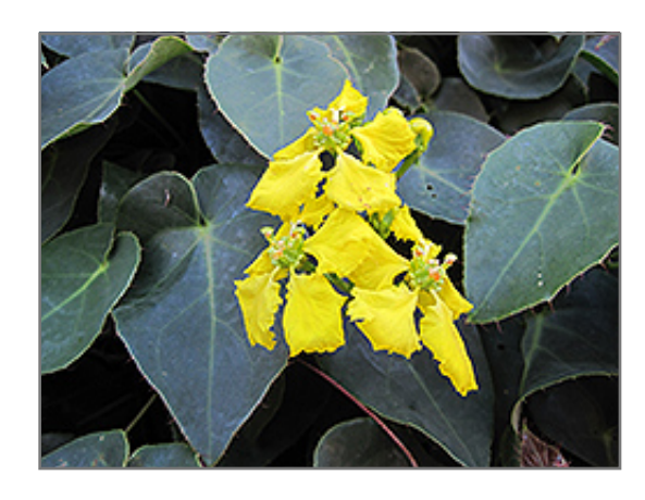
Orchid Vine flowers