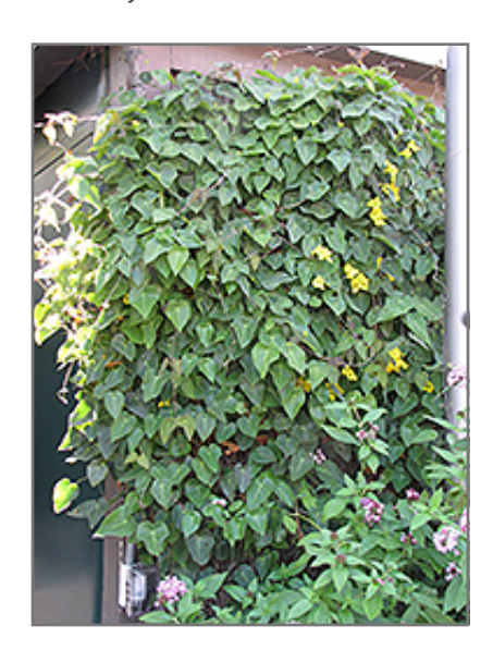
Orchid Vine