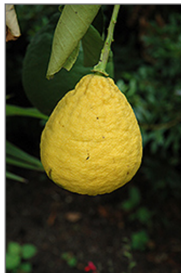
Ponderosa Lemon fruit

Aside from its primary use as an edible, Ponderosa Lemon is suitable for the following landscape applications;