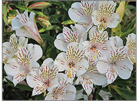
Casablanca Alstroemeria flowers

Casablanca Alstroemeria is recommended for the following landscape applications;