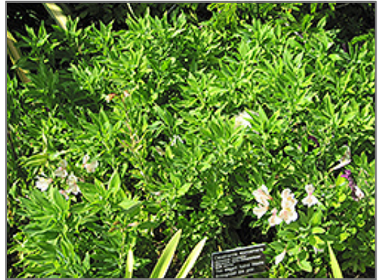
Casablanca Alstroemeria in bloom