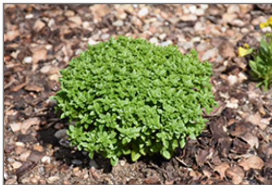
Boxwood Basil