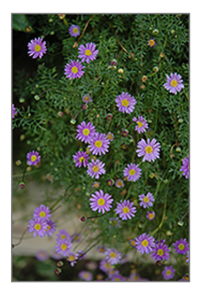
Amethyst Brachyscome flowers