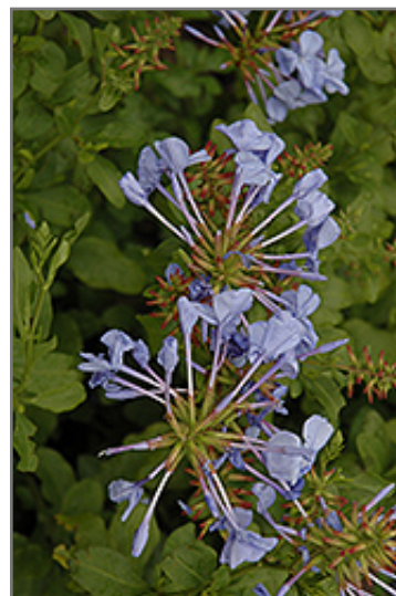
Blue Cape Plumbago flowers

An upright climbing shrub that will form a weeping mound if left on its own, but with a trellis or wall it will reach ten feet; stunning pale blue flower clusters bloom nearly year round; will die back to the ground in zone 8; an excellent container plant