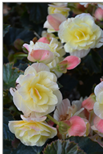
Solenia Light Yellow Begonia flowers

Solenia Light Yellow Begonia is recommended for the following landscape applications;