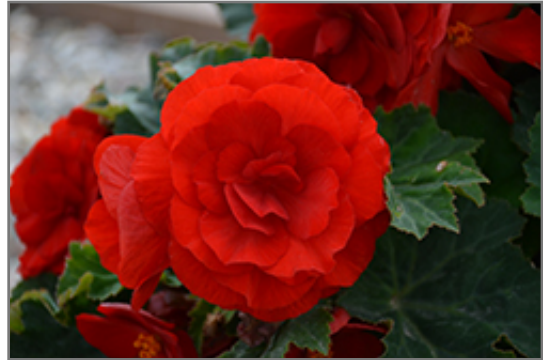
Nonstop Deep Red Begonia flowers

Nonstop Deep Red Begonia is recommended for the following landscape applications;