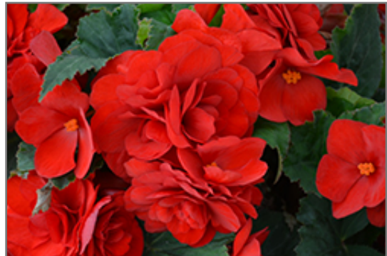
Nonstop Deep Red Begonia flowers