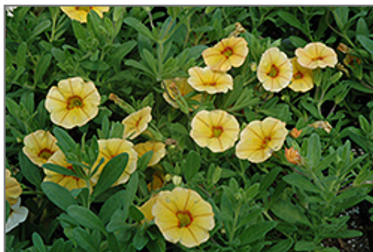
Aloha Gold Calibrachoa flowers