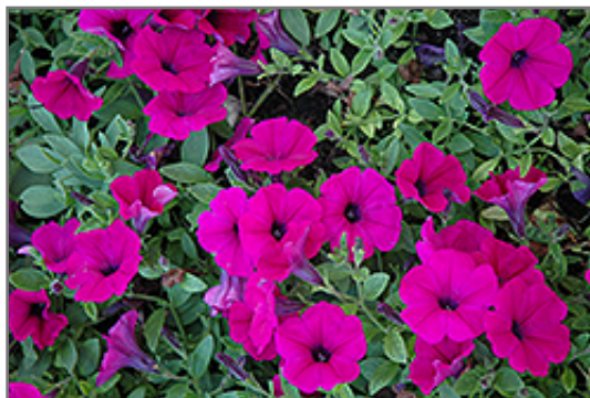
Wave Purple Classic Petunia flowers