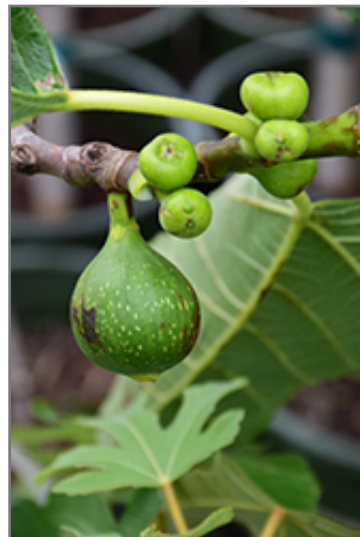
Kadota Fig fruit

Aside from its primary use as an edible, Kadota Fig is suitable for the following landscape applications;