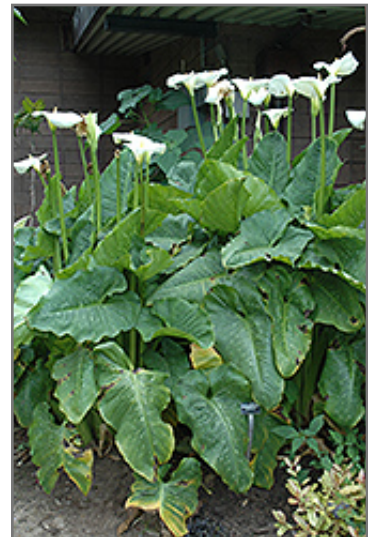
Hercules Calla Lily in bloom