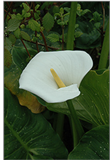
Hercules Calla Lily flowers

Hercules Calla Lily is recommended for the following landscape applications;