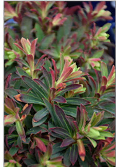
Tiny Tim Spurge flowers