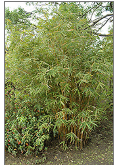
Alphonse Karr Bamboo foliage