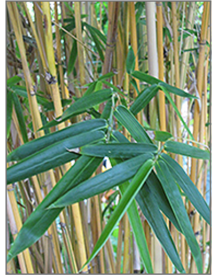
Alphonse Karr Bamboo foliage

Alphonse Karr Bamboo is a fine choice for the garden, but it is also a good selection for planting in outdoor pots and containers. Its large size and upright habit of growth lend it for use as a solitary accent, or in a composition surrounded by smaller plants around the base and those that spill over the edges. It is even sizeable enough that it can be grown alone in a suitable container. Note that when growing plants in outdoor containers and baskets, they may require more frequent waterings than they would in the yard or garden.