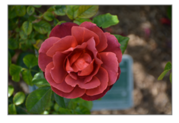
Hot Cocoa Rose flowers