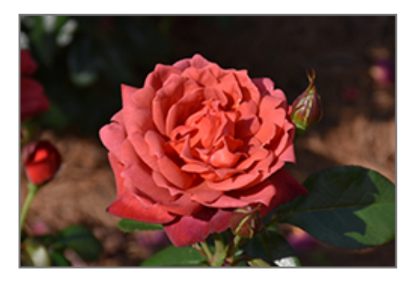
Hot Cocoa Rose flowers