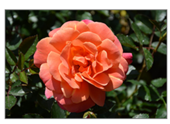
Disneyland Rose flowers

Disneyland Rose is recommended for the following landscape applications;