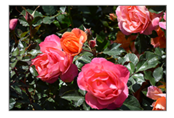
Disneyland Rose flowers