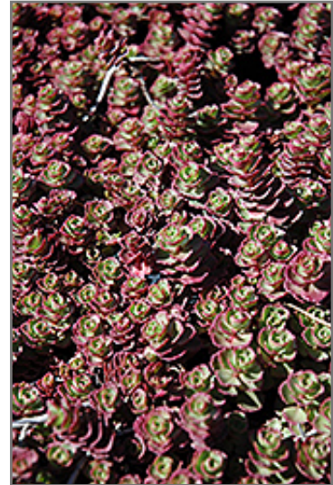
Red Carpet Stonecrop foliage

This plant will require occasional maintenance and upkeep, and is best cleaned up in early spring before it resumes active growth for the season. Deer don't particularly care for this plant and will usually leave it alone in favor of tastier treats. Gardeners should be aware of the following characteristic(s) that may warrant special consideration;