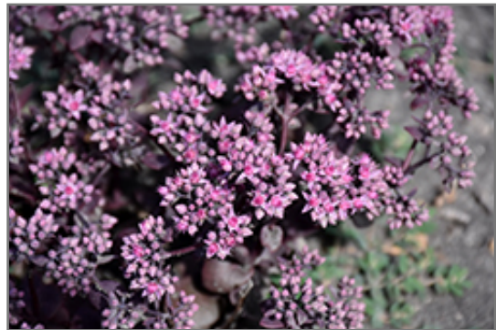
Red Carpet Stonecrop flowers