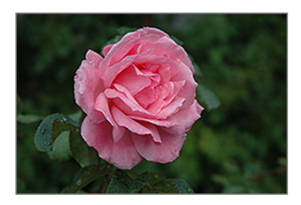
Queen Elizabeth Rose flowers

Queen Elizabeth Rose is recommended for the following landscape applications;