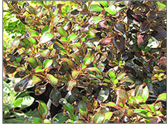
Karo Red Mirror Bush foliage

Karo Red Mirror Bush is recommended for the following landscape applications;