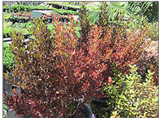
Pacific Sunset Mirror Bush